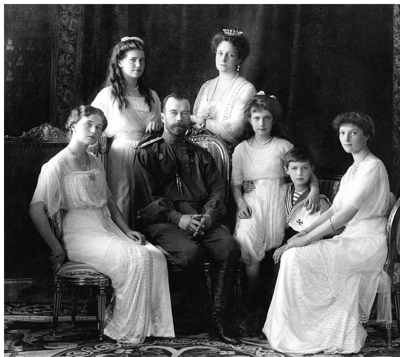
The Romanov Royal Family (left to right): Olga, Maria, Nicholas II, Alexandra Fyodorovna, Anastasia, Alexei, and Tatiana. 1913.