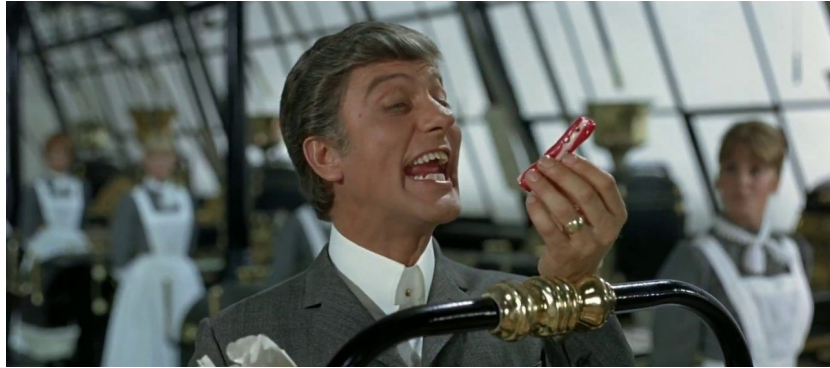
Mr. Potts and his Toot Sweets candy from the film "Chitty Chitty Bang Bang"

Be sure to draw and describe them in detail, including what they would do, what they would look like, what they might smell like, and what they would taste like!