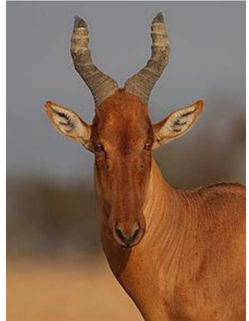
A Hartebeest or African Antelope.

Now the naming... Ah ah ah oh way ah It is done! All done!