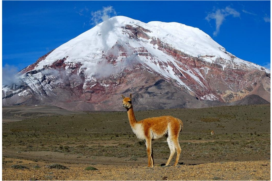
A vicuña near the Chimborazo volcano in Ecuador. Vicuña are South American camelids that live in high elevation regions of the Andes mountains.

Separate into small discussion groups and write your answers below.