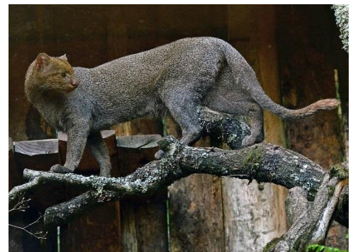
A jaguarundi, a big cat native to the Americas from Argentina to Mexico.