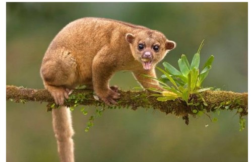
A Kinkajou, a mammal who lives in tropical rainforests.