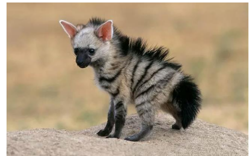
An Aardwolf, native to East Africa and Southern Africa.