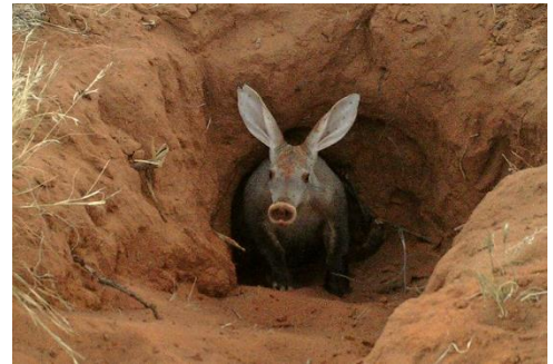
An African Aardvark in a burrow.