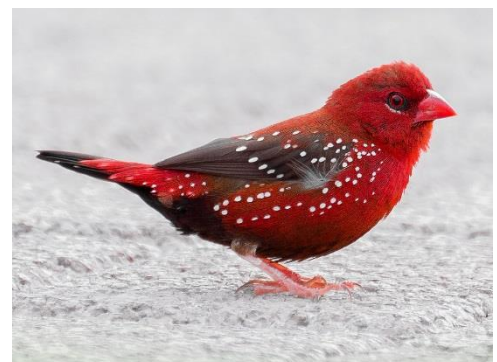
An Axolotl from the tropical regions of Asia.